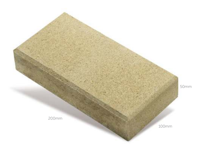
Havenbrick® 50 50 units per m²