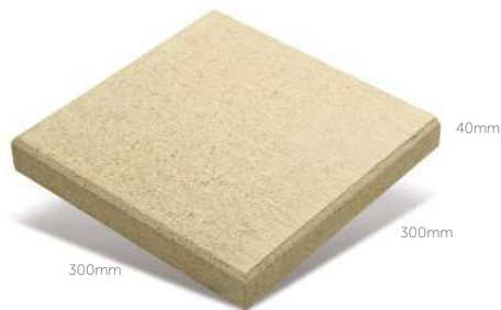
Stradapave® 40 11.10 units per m 2