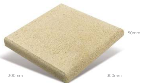
Stradapave® Bullnose (50mm only) 3.30 units per lineal metre