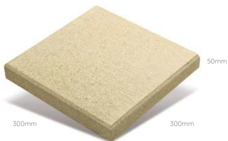
Stradapave® 50 11.10 units per m 2