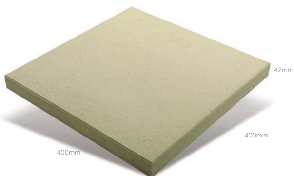
Euro® Classic 6.25 units per m 2