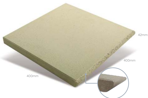
Euro® Classic Sharknose 2.50 units per lineal metre *This product is made to order, lead times apply.