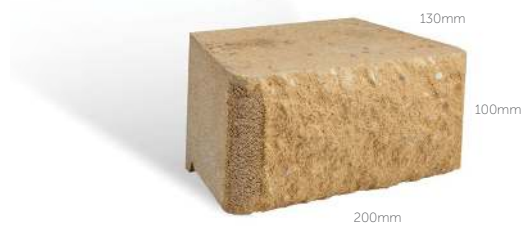
Hudson Stone 5 units per l/m

Maximum non reinforced height 300mm (3 courses)